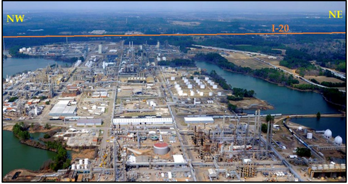
Figure 1. Aerial view of Eastman Chemical production process area in Longview Texas. View is from the South looking North. Interstate Highway 20 (I-20) is just to the North of the property. EC owns additional land beyond the lakes, especially to the Southeast on right side.